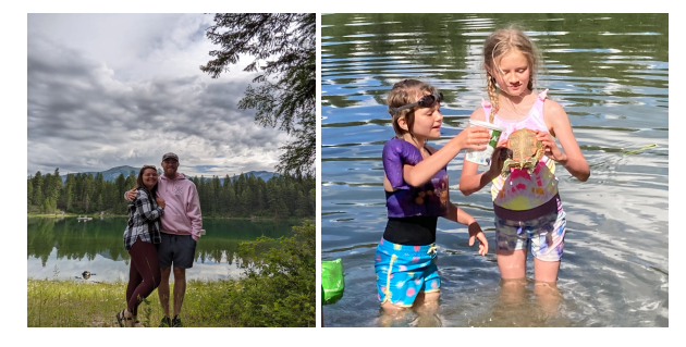
Rock Lake Camp: 4085, Rock Lake Rd, Elko, BC

It's a great time for the whole family to unplug and relax. We all chip in together to prepare the meals and clean up afterward ensuring that everyone gets time to unwind and enjoy. If you can only make it out for a day come on out and enjoy the Lake and fellowship with us.